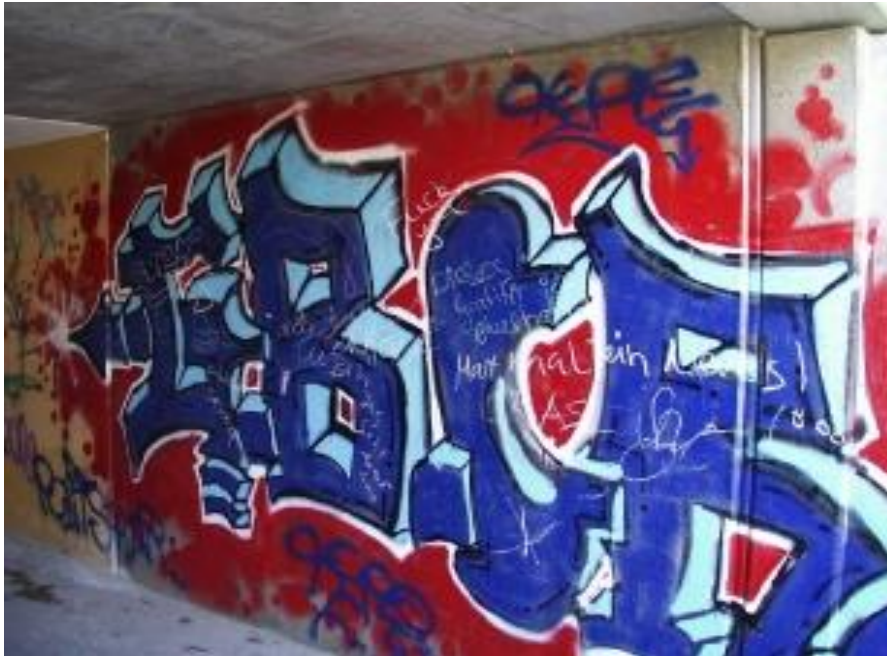
Caption: Protectosil ANTIGRAFFITI® keeps buildings graffiti free.